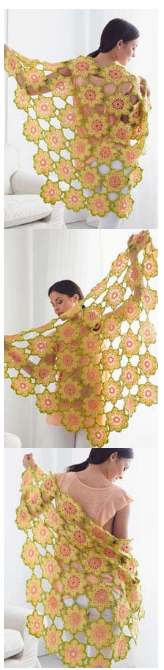
click image to enlarge

One size US H-8 (5 mm) crochet hook, or size to obtain gauge